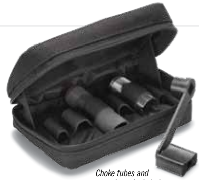
Choke tubes and wrench not included